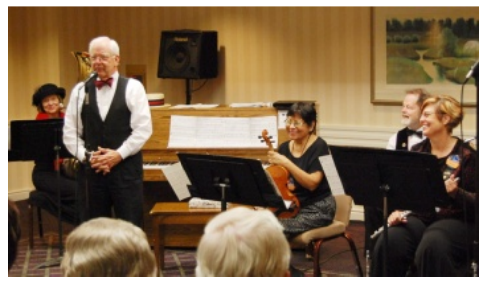
The Porcupine Ragtime Ensemble gave the audience, at last year's Ragtime Corners, a healthy helping of ragtime, and will again this year. All three evenings at 8:00 p.m.