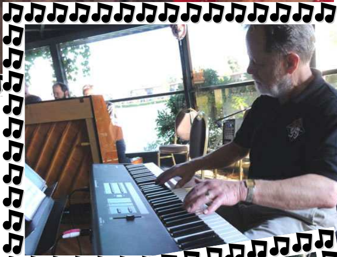
Photos from the 33rd anniversary of the Sacramento Ragtime Society, March 29, 2015